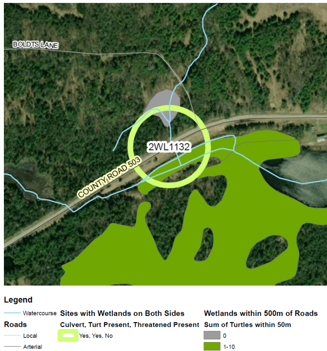
FIGURE 2: REFINED-REMOTE ASSESSMENT OF POTENTIAL ECOPASSAGE SITES